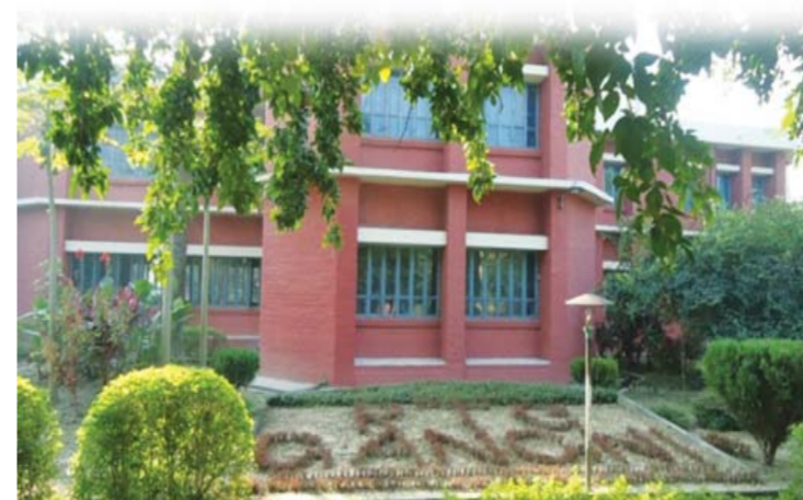
RTC, Gangni, Meherpur